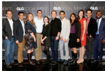
GLG Social Impact Fellows

GLG Social Impact launches, bringing GLG's learning platform to the social sector as it begins working with nonprofits.