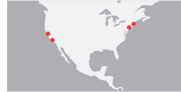
GLG's offices around the United States

GLG continues to expand by region. It now has new offices in San Francisco, Boston, and Los Angeles.