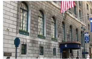
Yale Club, New York City

GLG begins hosting small meetings with biotechnology investors and physicians/scientists over breakfast at the Yale Club in New York City.