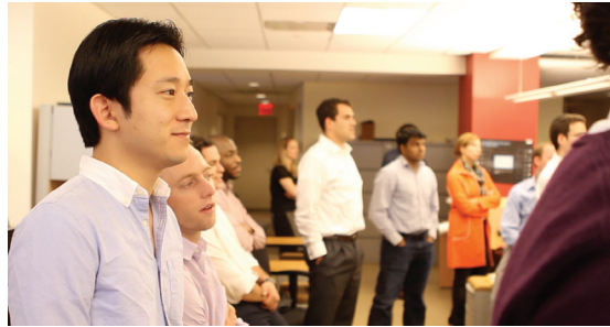
GLGers at company Town Hall

GLG has almost 750 employees worldwide, including 115 sales professionals, 275 research professionals, and nearly 20 employees in legal and compliance.